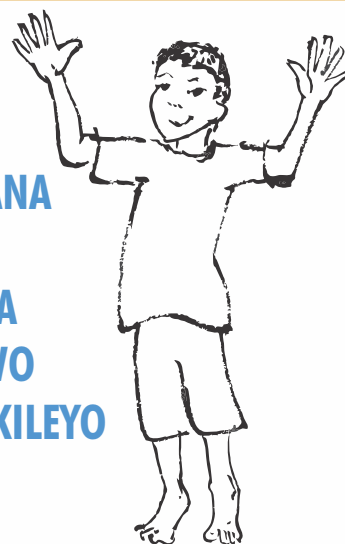
UMNTWANA WAKHO UZA KUBA NEENYAWO EZOLULEKILEYO

PHAKAMA WENZE NGOKU. THINTELA UKUKHUBAZEKA!